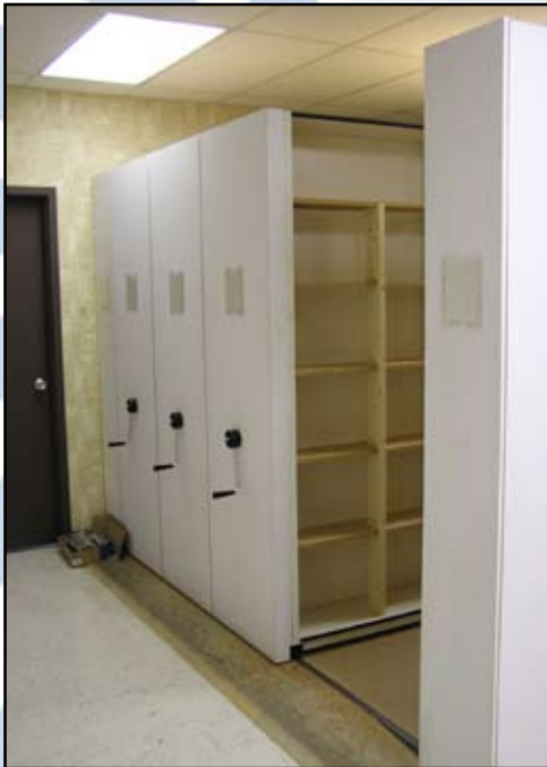
Rolling File Shelves